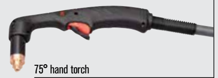
75° hand torch

(for more torch options, see www.hypertherm.com )